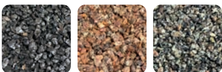
Colour examples for separately bought grit/gravel